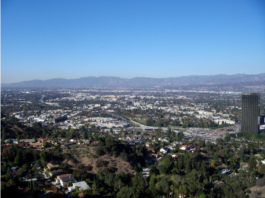
The San Fernando Valley: looking north from the Universal City area.