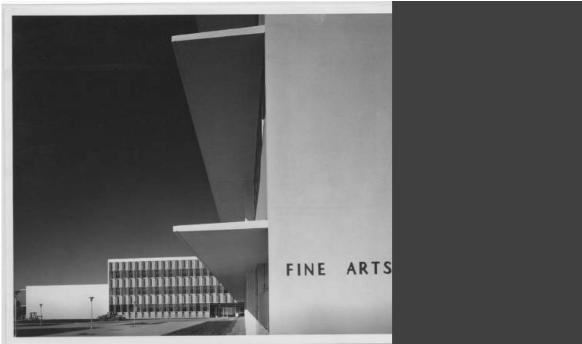
Richard Neutra's Fine Arts Building at San Fernando Valley State College (now California State University at Northridge (CSUN). Completed in March 1960.